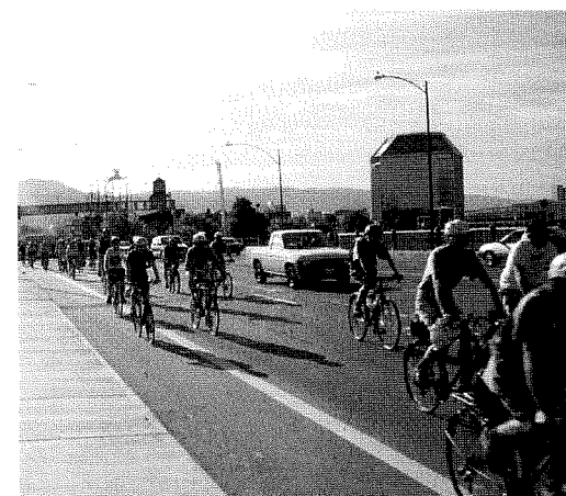
Reconfigured span of Burnside Bridge, with added bicycle lanes.