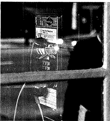
Three regal red phone boxes stand at attention under the awning of the Telephone Bar and Grill. The taxi and the pay telephone inside betray the phone boxes' true location: New York City.

color of public utilities in Britain (hence the red buses and mailboxes). British Telecom wanted to be done with that: yellow and blue are its corporate colors (although it still uses the red phone box as its logo).