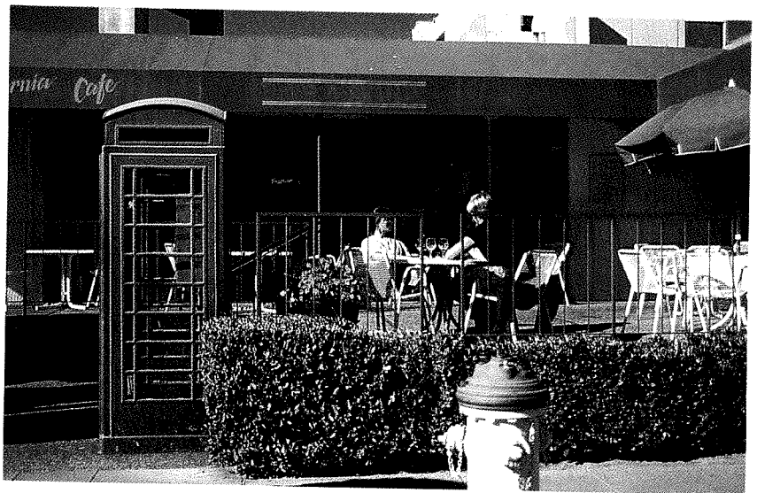
Refurbished phone boxes are being spirited to the United States. In San Francisco a phone box (repainted turquoise) sits outside the California Cafe.