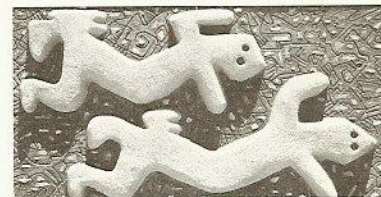
Left and above: “Our Shared Environment” (Thomas Road Overpass), 1990. Artist: Marilyn Zwak.

The Phoenix Arts Commission plan sought to put “place back into infrastructure.” Many of the projects inspired by the plan have, indeed, created links between project and place, between human culture and the deep structure of the region. The surface landscape now reflects the deep structure in new and interesting ways. But the most successful projects still require connections to the local population.