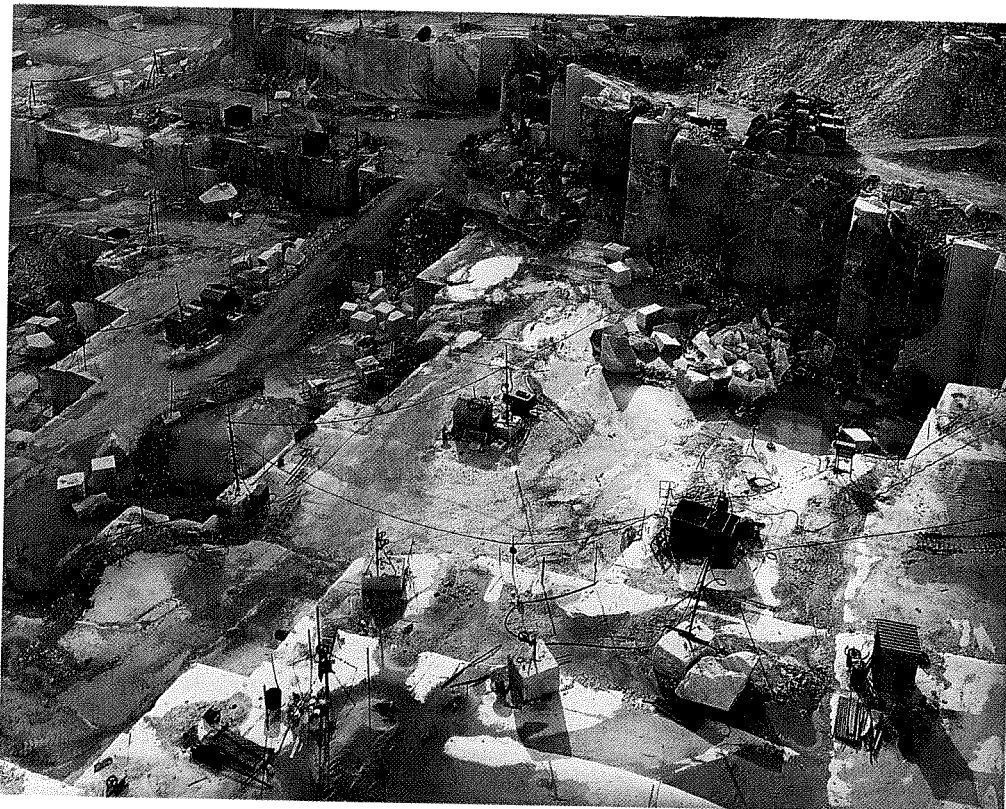
Cover: The Gioia quarry.