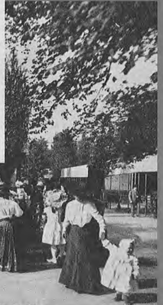
The Terrace and Bethesda Fountain, Central Park, New York City.