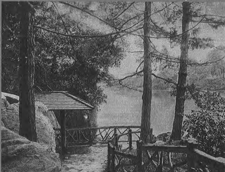
NOOK IN CENTRAL PARK NEW YORK