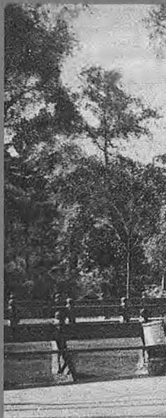
The Mall Central Park, New York.