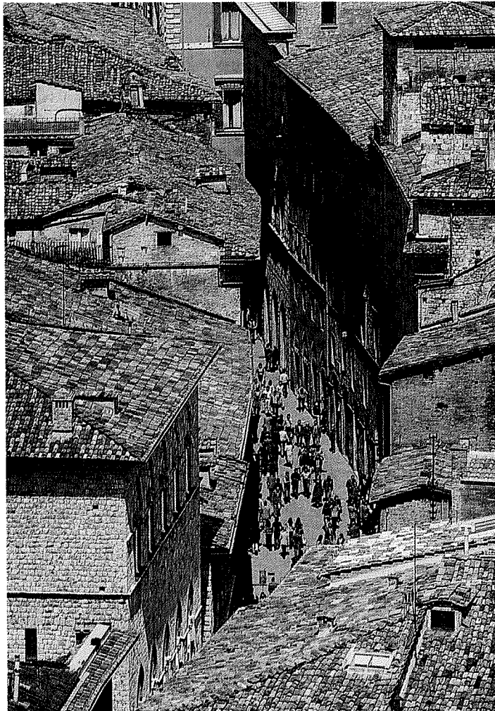
A street winding through Siena.

Nevertheless, one cannot imagine that it is enough to prevent cars from running along roads to make these roads interesting. It doesn't seem possible, because cars have an irresistible attraction and it is therefore unthinkable that they can be done away with, and because roads in the periphery, having been designed for car needs, can change only if they are redesigned in order to correspond to a set of more complex needs, to the combination of car and human needs.