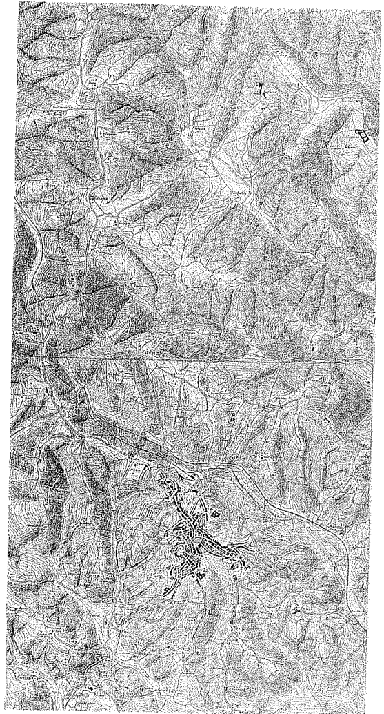
Plan of Siena and its region. Courtesy Giancarlo De Carlo.

The major difference between human motion and car motion is that the first is of man or woman, therefore "organic," whereas the second is of machine and therefore "inorganic." One could observe that cars are driven by human beings and are "instruments" governed by organic will. But this does not change a thing.